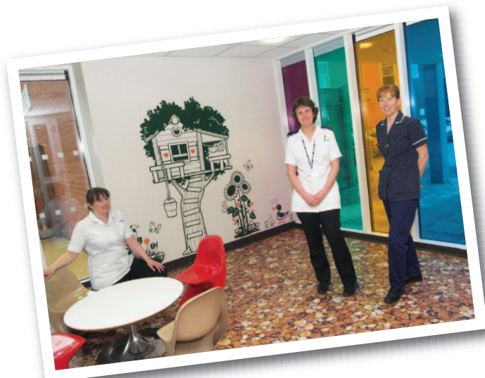
OPEN DOORS: Staff from the Children's Outpatient Department show off the brand new playroom area.