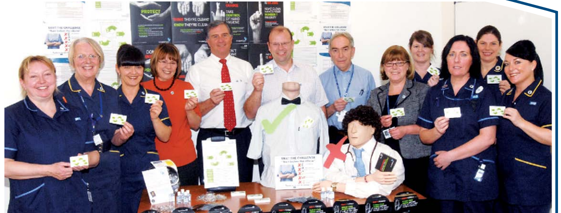
KEY MOMENTS: Staff launching the hand hygiene campaign.

Staff, patients and visitors are being encouraged to consider hand hygiene in a new drive to tackle so-called 'superbugs' like MRSA and Clostridium difficile.