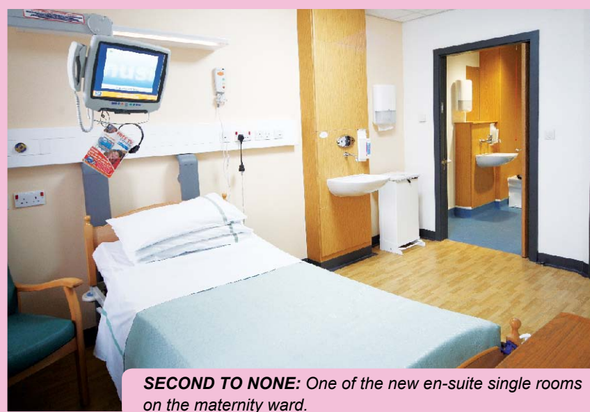
SECOND TO NONE: One of the new en-suite single rooms on the maternity ward.

Extensive progress has been made on our £11.5 million scheme to transform women and children's services at Arrowe Park Hospital.